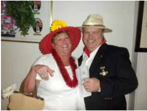
Mr & Mrs Thurston Howell, III