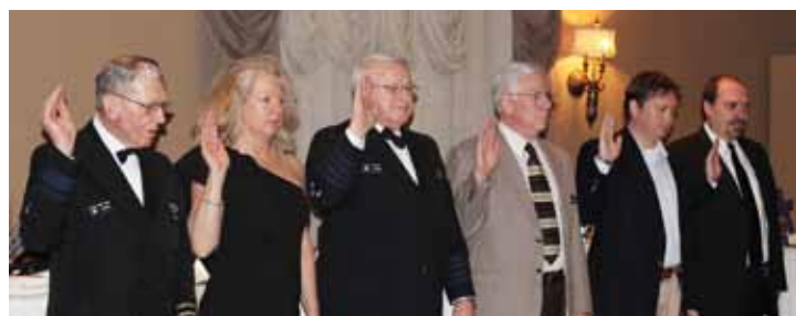
Members at Large being sworn in.