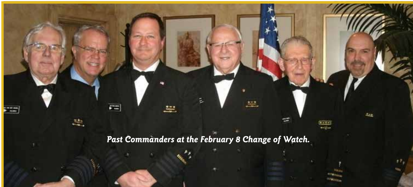
Past Commanders at the February 8 Change of Watch.