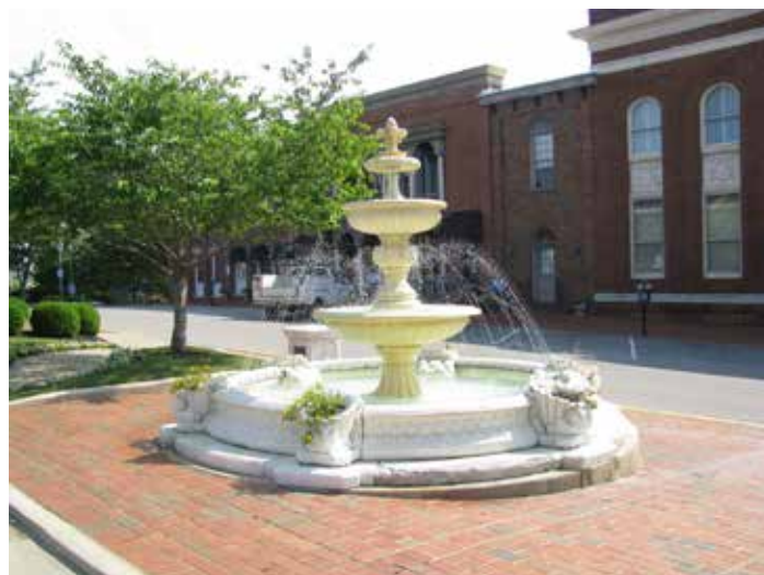
Figure 4 - Fountain dedicated to the town's fighters.

Our first day's journey ended in the Tennessee River town of Clarksville. This historic city (fifth largest in the state) has recently completed construction on a gorgeous riverfront development project and our group benefited from its amenities: dockage under roof, gas and pump out, beautiful park and friendly staff. Clarksville offered a historically preserved architectural downtown, new businesses with art galleries and places that served good food and adult beverages. Valiantly led by