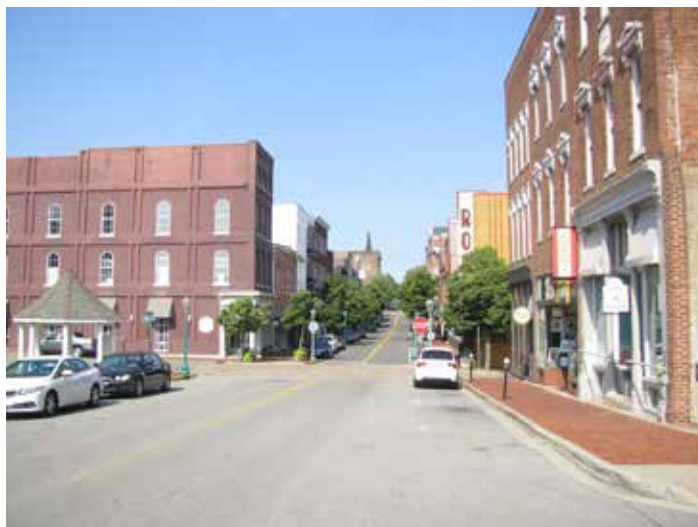
Figure 3 - Clarksville's historic main street.