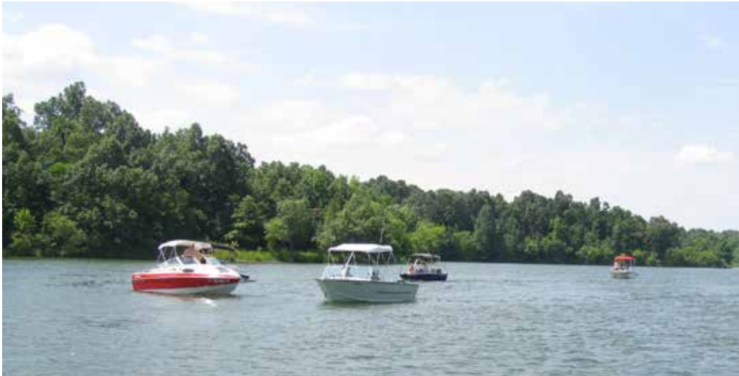
Figure 1 – The 'Second Invasion Fleet' assembling at Kentucky Dam Marina.

Lake-Between-The-Lakes, KY – Columbus Sail and Power Squadron boaters have a regional, if not national, reputation for being eager road boaters. We love to hitch the boats up and head on down the highway. Traveling to far away places, experiencing all the wonders that this great nation has to offer. Lake-Between-The-Lakes was our 2016 voyage-of-the-year cruise. We came looking for new experiences, tranquility and the joy of friendships, all offered in abundance by members and guests of CSPS and District 29. We found them in spades.