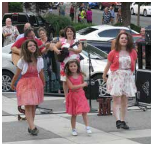
Figure 6 – Future Opry Stars start young. Very talented and accomplished performers.

about this crazy experiment in democracy. These guys are the ones that rolled up their sleeves and went to work building America. Teachers, policemen, small business owners, firemen. Helping other people thru education, ready to lend a helping hand to any boater, standing up when the American flag goes by, respecting others and the environment and striving to improve their