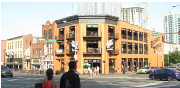
Figure 5 - How can you go wrong with a three story honky tonk?

Tuesday thru Thursday night were spent enjoying 'Athens of the America.' Nashville is a town rich in history and alive with the commerce of modern life. Andrew Jackson's Hermitage offers the finest drink of spring-fed water in America. The city has fine gardens and parks. Universities abound with lots of their graduates staying put. But like most shallow, simple minded sailors we headed for the bars and honky tonks of Broadway Street with all the temptations of the Grand Ole Opry. We were not disappointed. Tootsies, BB Kings, the Stage, Legends Corner all served up cold beer and hot licks music. Every wanta' be country star has to play everywhere on