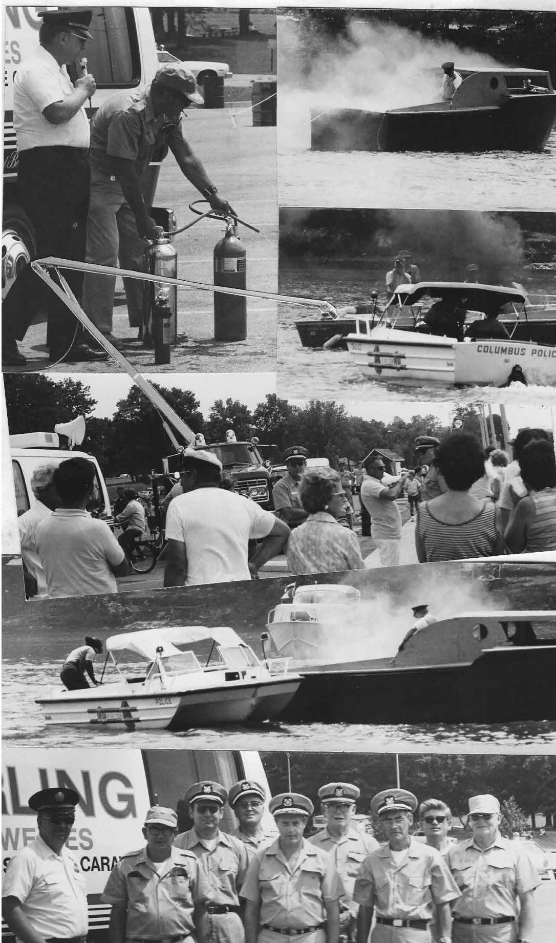
1975 CSPS hosted a fire safety demonstration on the Scioto. Burned up a boat. In conjunction with Columbus Fire and Police. Good turnout.