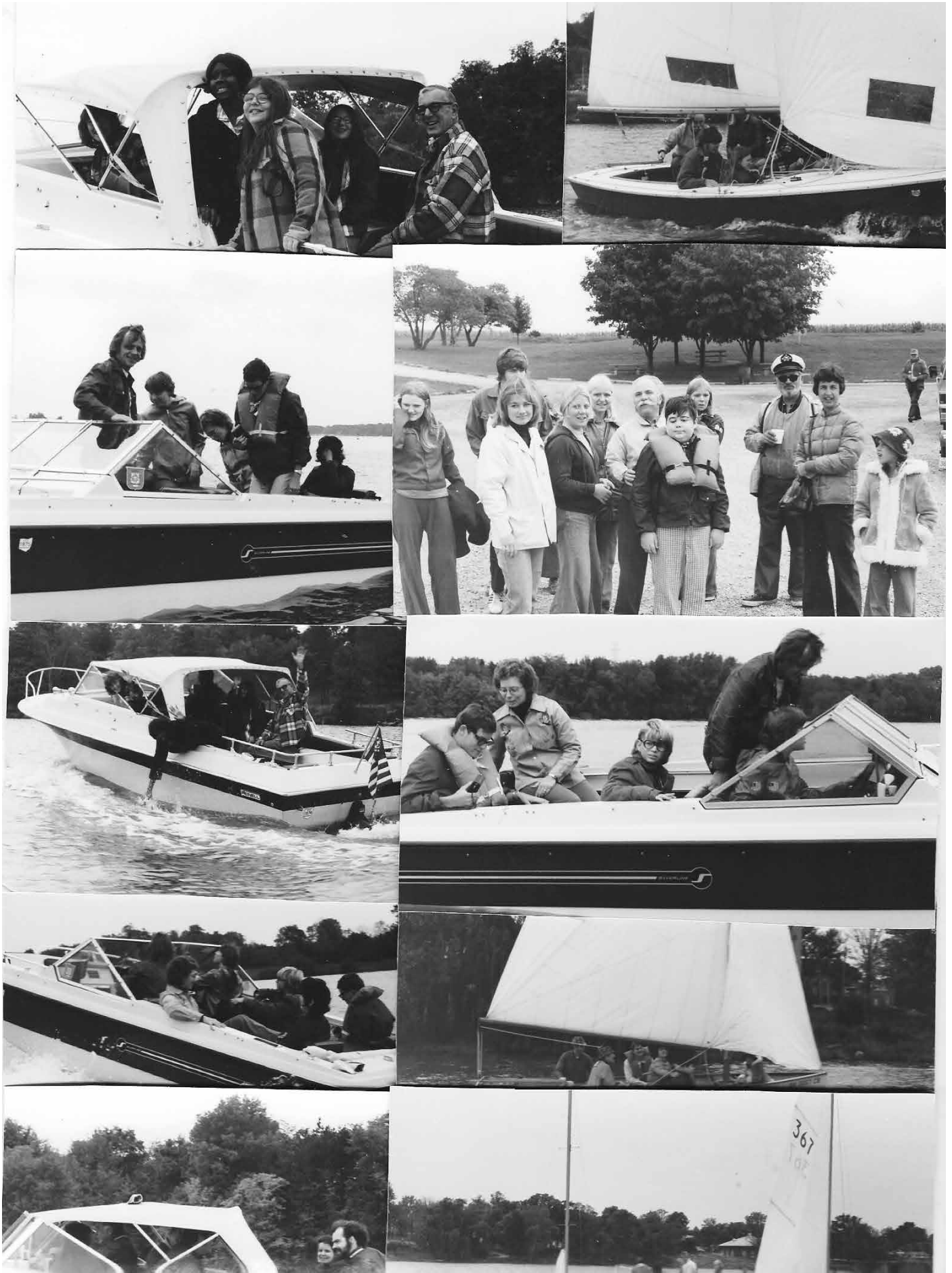
1975 Blind School outing. An event that we did for many years.