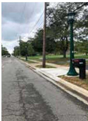
Fig. 2 New poles from Kenney to Greenview

On to the specifics of my beef. Stay with me. This section of McCoy is 9/10's of a mile long. Its dividing line, Greensview Drive, is 4/10's of a mile from Kenny and 5/10's of a mile from Reed, roughly equal. The new street lights were installed between Kenny Road and Greensview Drive. This was to finish the existing lighting to Reed. Here's my issue.