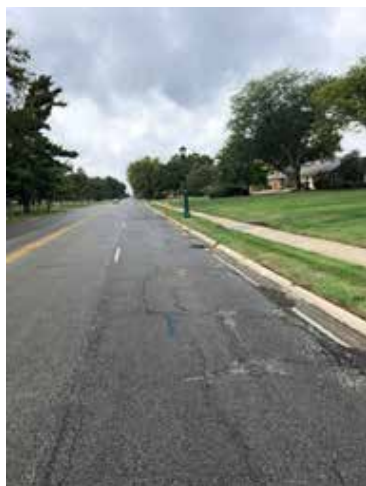
Fig. 1 The original light poles

McCoy Road between Kenny and Reed tracks across the northern boundary of The Ohio State University's Scarlett and Gray Golf Course. A beautiful bucolic setting. Elegant homes on large lots look across McCoy to Jack Nicholas's manicured playground. These very nice homes are graced with mature trees and feature beautifully manicured lawns. At night, the street lighting produces an effect which is dappled thru the heavily leaved overhanging branches. In winter they present a shadowy outline of a Central Park scene.